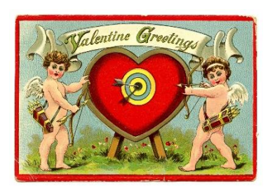
Happy Valentine's Pay